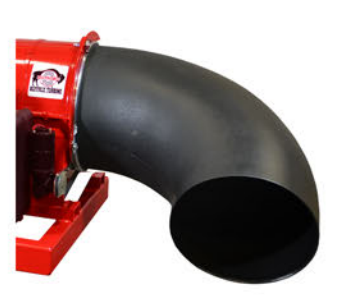
Aerospace Polymer Nozzle - Part# 2851 Standard Clamp Band - Part# 1173